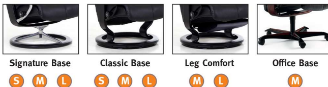
Signature Base S M L